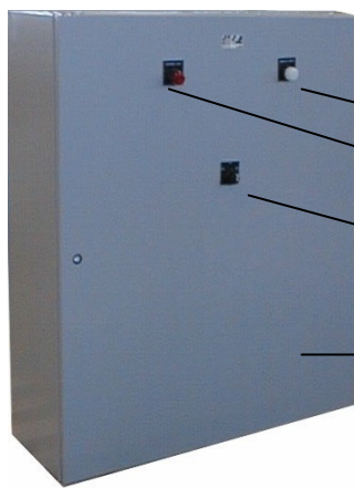
STANDARD 12, 30 AND 42 POLE VERSIONS