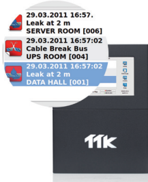
Simultaneous alarms displayed on one screen