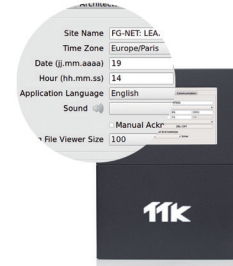
User-friendly interface of configuration