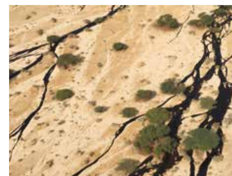
Oil spill at Evrona Nature Reserve

TTK hydrocarbon leak detection system in the Oil & Gas industry is specially designed to be installed in different environments, such as tank farms, pipelines, airports and refineries. The system is capable of detecting gasoline, fuel, crude oil, and jet fuel amongst others. Early detection with accurate location of oil leaks provided by the system allows reacting at a very early stage thus preventing environmental damage.