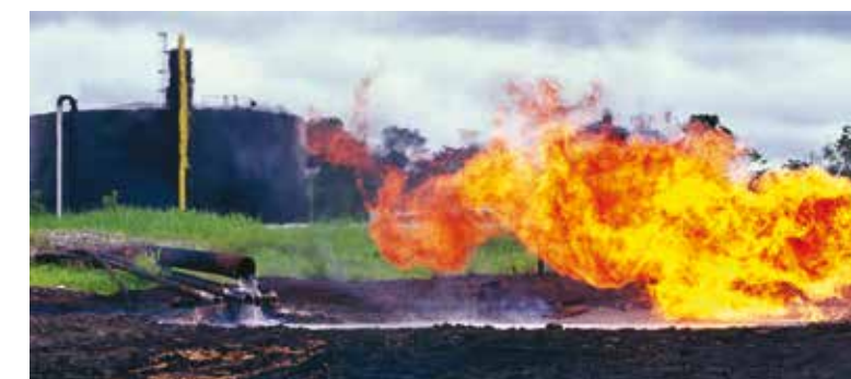
Oil contamination to water and land